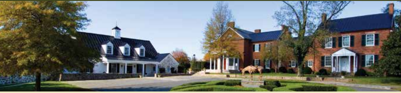
NSLM campus