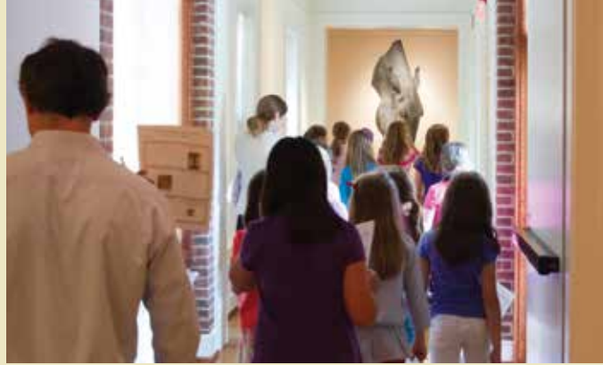
Student tour group learning about the sculpture, Still Water, 2011, by Nic Fiddian-Green in the NSLM's permanent collection