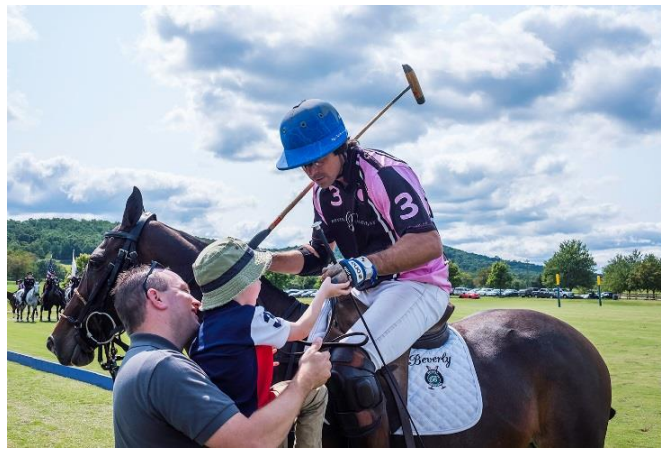
Nacho Figueras and a young fan at 2017 NSLM Polo Classic