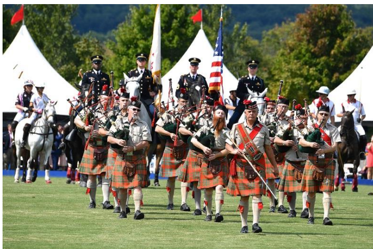
St. Andrews Society of Washington, DC Pipes and Drums perform at 2017 NSLM Polo Classic