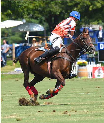
British Military Team player at 2017 NSLM Polo Classic