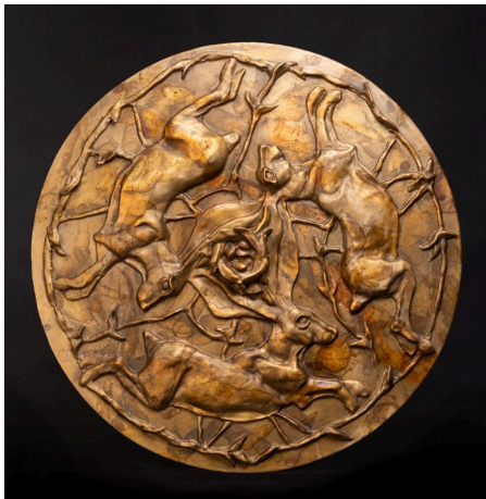
Celtic Rabbits by Diana Reuter-Twining, Bronze, 24x24x1, 2025