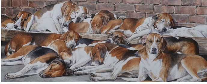
Bunk Bed by Melinda Brewer, Watercolor, 10x24, 2024